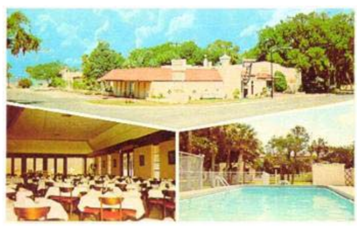
Post Card from around 1970

About 1950 Edith Holbert assumed ownership of the Jungle Prada, converting the garage portion to apartments and a large lounge with fireplace. The grocery was converted to lobby and restaurant space. On the waterfront, a pool and pavilion were added. On the North, 16 efficiency apartments were constructed.