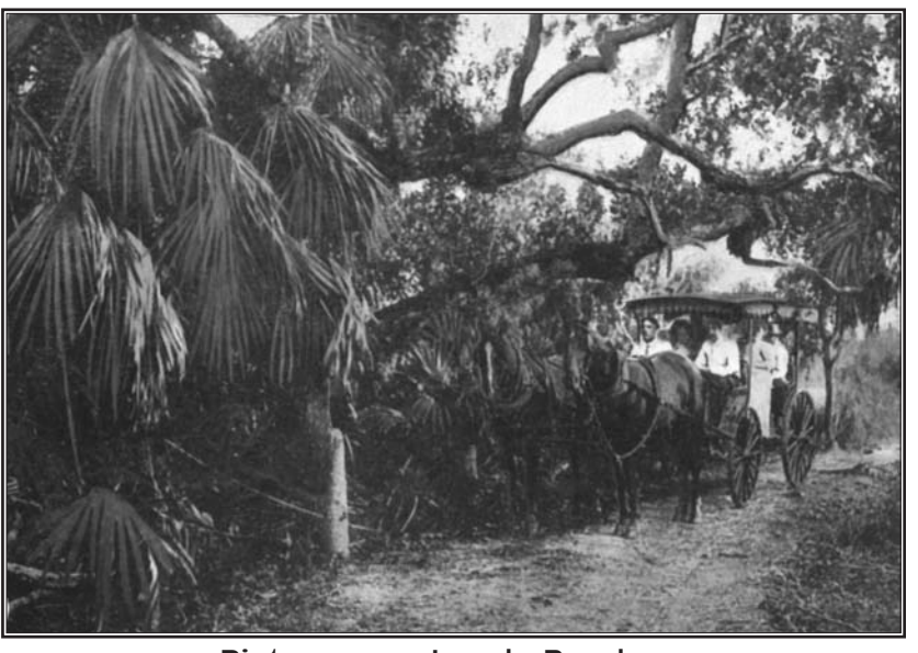
Picturesque Jungle Roadway St. Petersburg, Florida