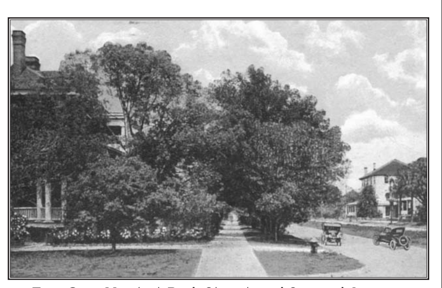
Two Cars Meet at Park Street and Second Avenue St. Petersburg, Florida

In 1970, The City of St. Petersburg acquired the Jungle Park property on 1700 Elbow Lane to prevent commercial development of the site and designated it the Jungle Prada Park.