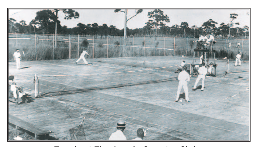
Tennis at The Jungle Country Club St. Petersburg, Florida