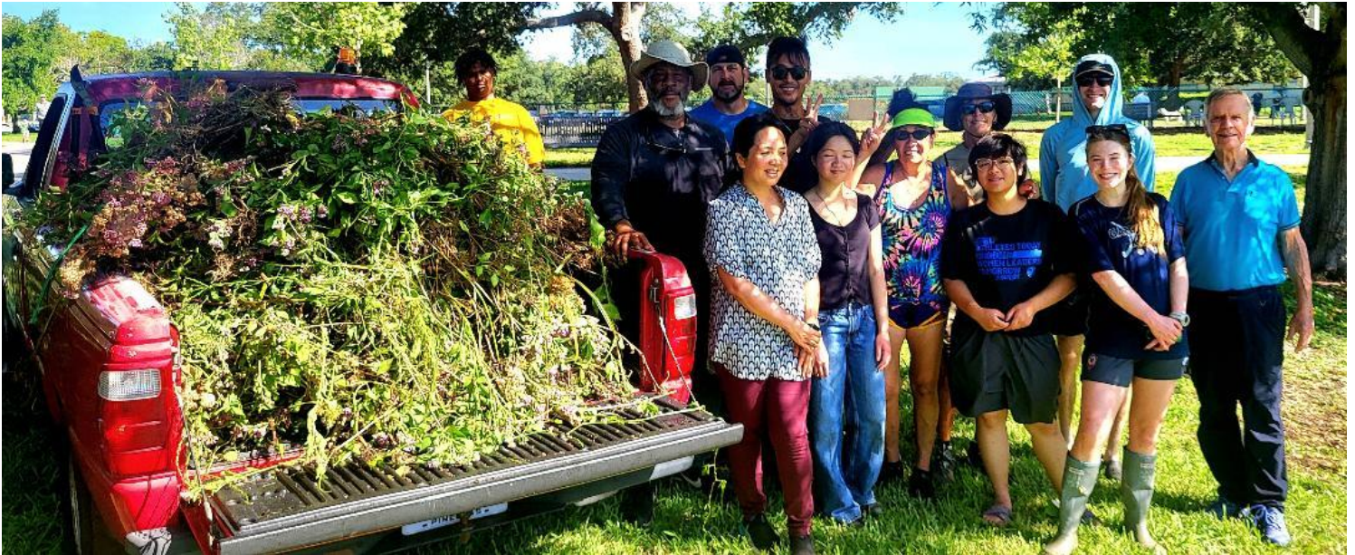
Truck load of Joe Pye Weed from north Berm