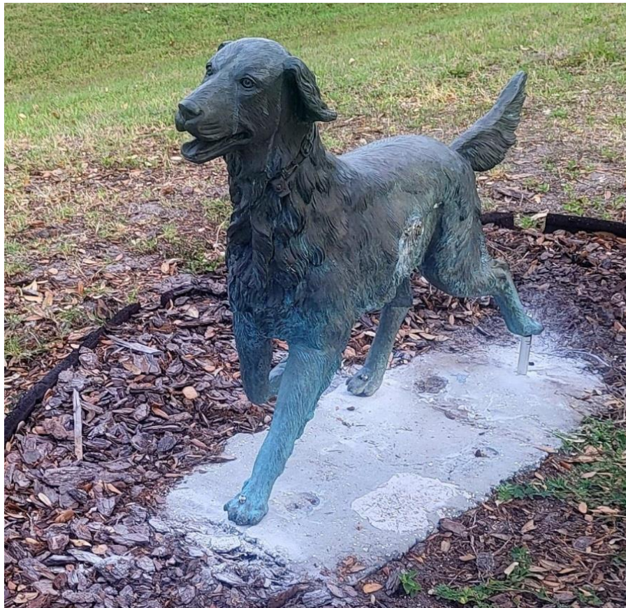
Proudly eager to see friend Girl Reading Book in Garden.