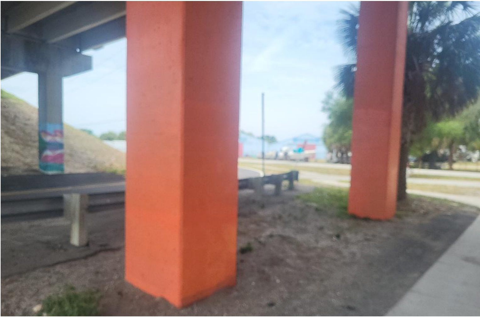
New Paving up tight to pillars!