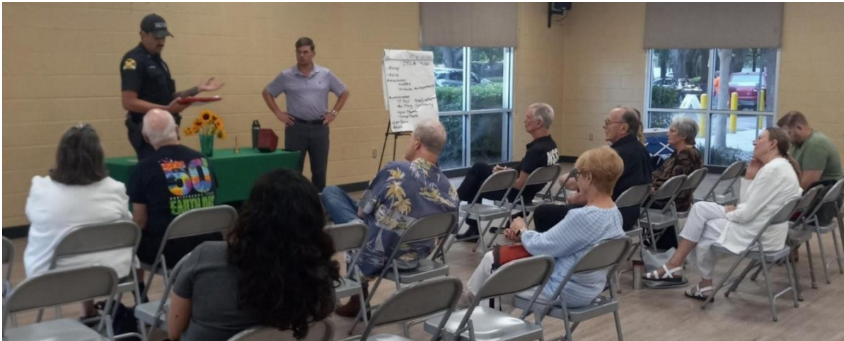
Our New Community Police Officer speaks to group.