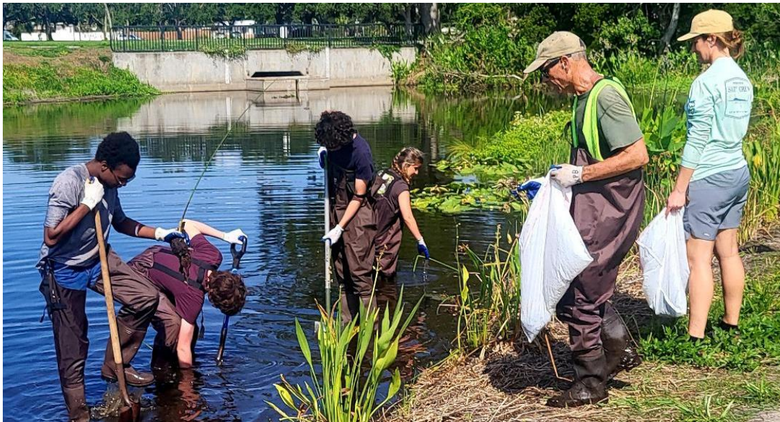
Planting 167 Bull Rush in Our Lake!