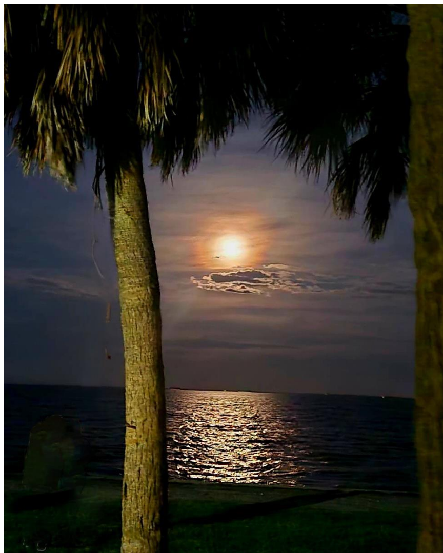
Moon over bay . . .