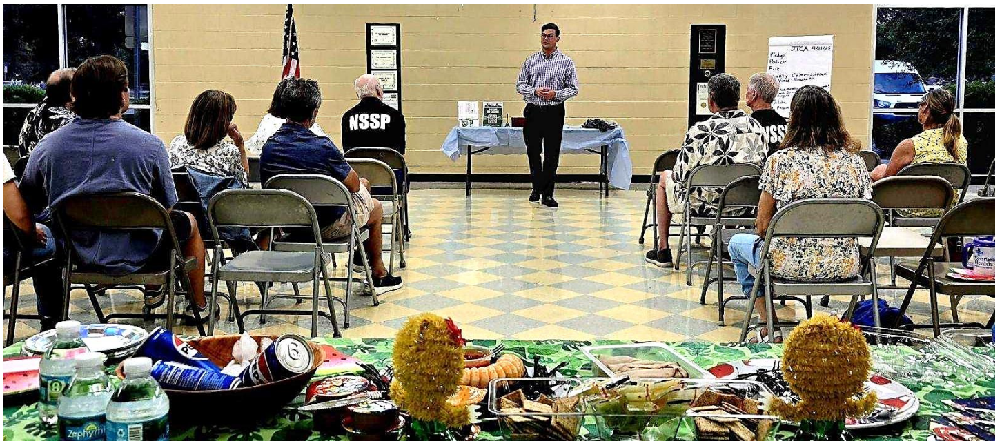
Full attention by audience!