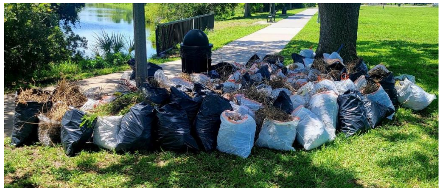
Litter Patrol – 2 Canoes. 36 Bags of Dead Grass + 17 Bags prior week=53