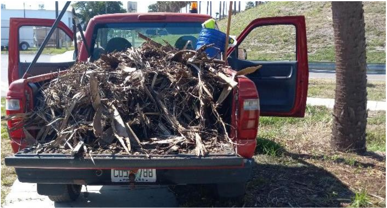
Final of 4 truckloads of palm bio-litter to Brush Site Where Stonehenge Park contract workers piled them for years.