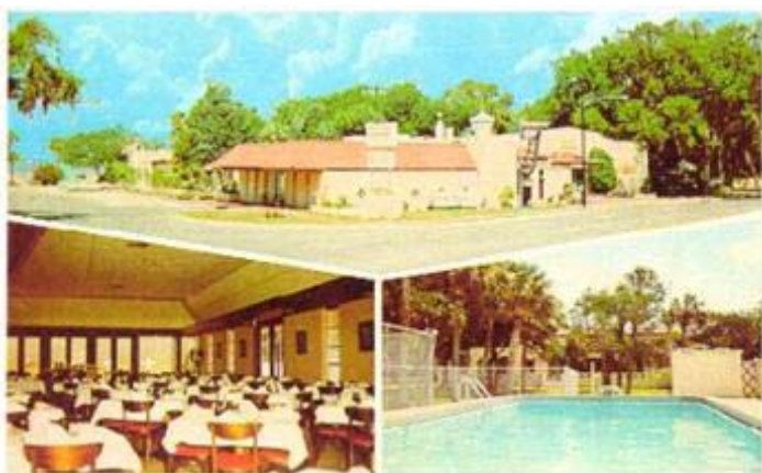
Post Card from around 1970

About 1950 Edith Holbert assumed ownership of the Jungle Prada, converting the garage portion to apartments and a large lounge with fireplace. The grocery was converted to lobby and restaurant space. On the waterfront, a pool and pavilion were added. On the North, 16 efficiency apartments were constructed.