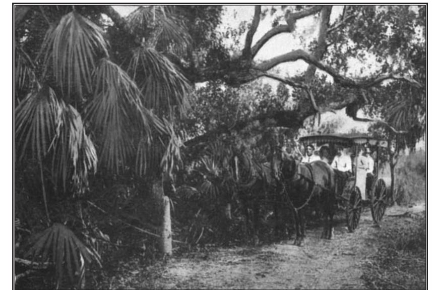
Picturesque Jungle Roadway St. Petersburg, Florida