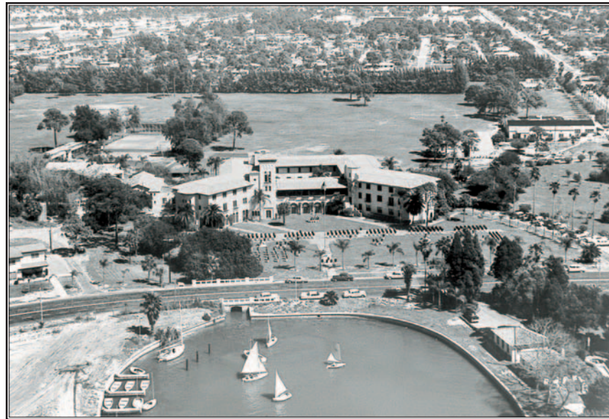
Originally the St. Petersburg Country Club, later named The Jungle Country Club - St. Petersburg, Florida