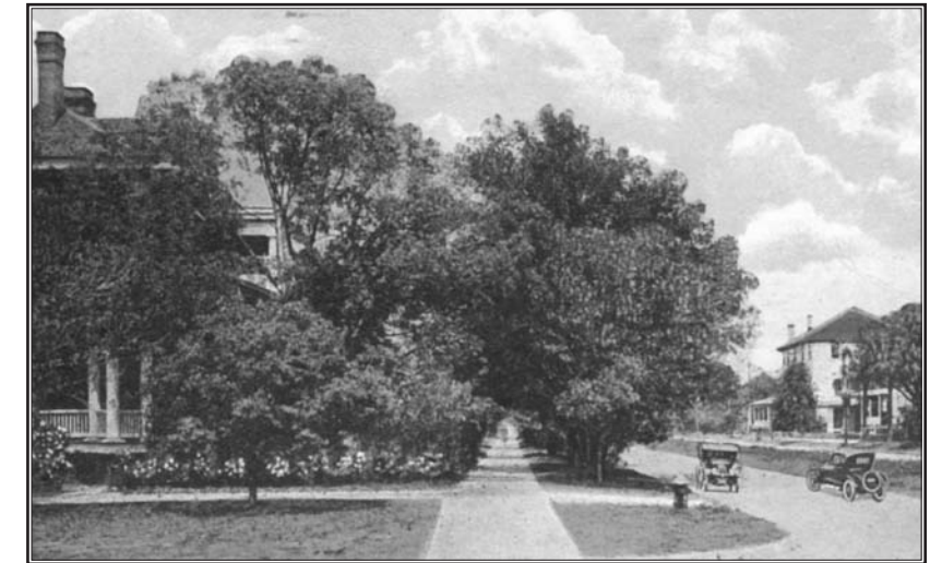
Two Cars Meet at Park Street and Second Avenue St. Petersburg, Florida

In 1970, The City of St. Petersburg acquired the Jungle Park property on 1700 Elbow Lane to prevent commercial development of the site and designated it the Jungle Prada Park.