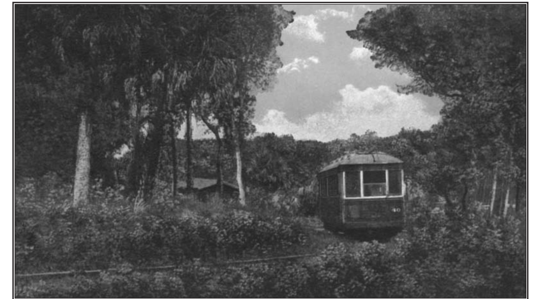
A Trolley Car Makes Its Way Through The Jungle St. Petersburg, Florida

Ciega Bay (where the Fullers owned a large amount of land). The first phase was completed to 28th Street in February 1913 and on to Boca Ciega Bay later that fall. The trolley line was extended the full distance down Central Avenue – seven miles straight across the peninsula to the wilderness area that Walter P. Fuller named "the Jungle" The street turned North to what is now called Park Street and to Elbow Lane. It turned around at Elbow Lane and made the trip back to town. A wooden pier was built in December 1913 at the foot of Elbow Lane.