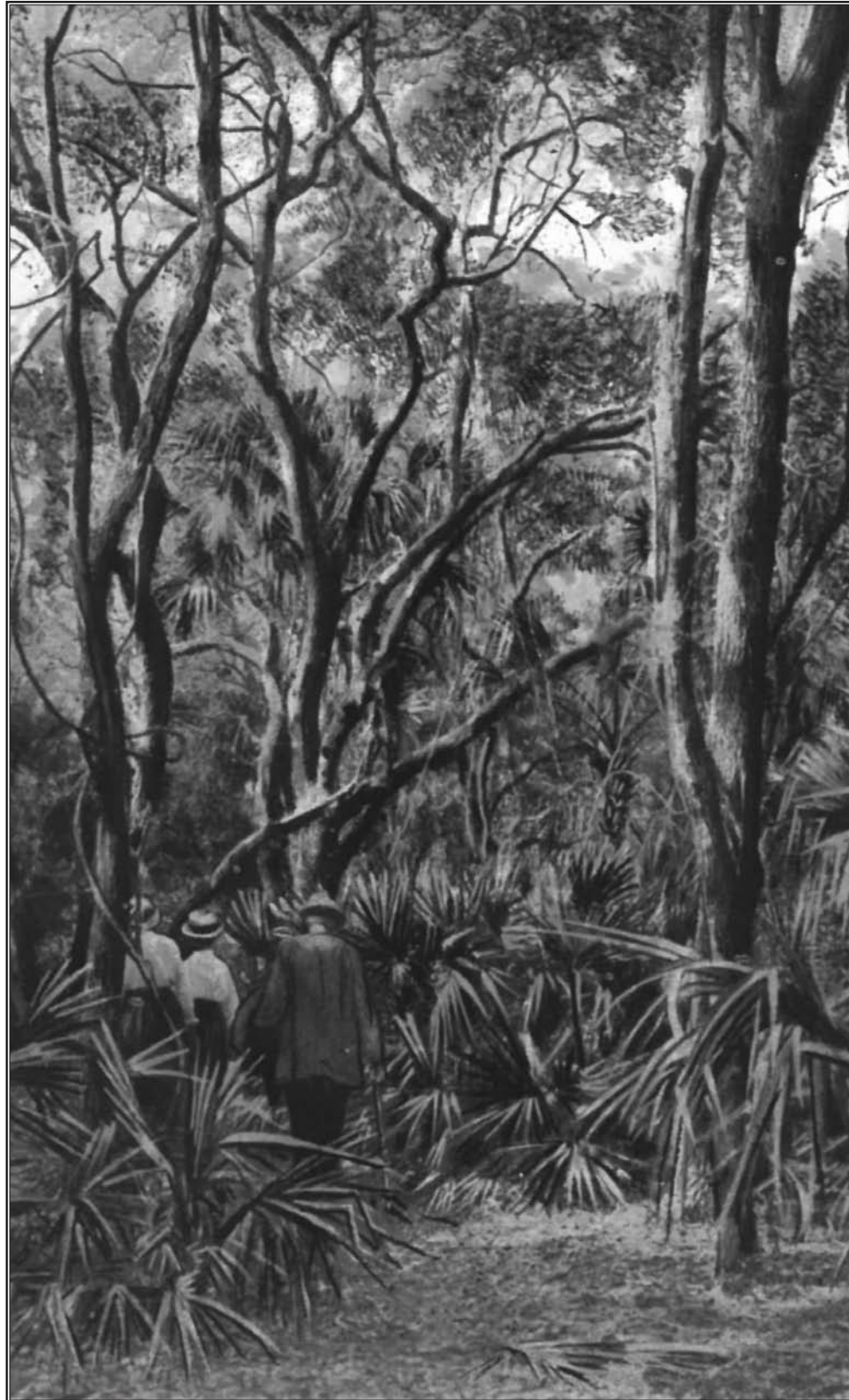
Palmettos and Scrub Oak in the Depths of The Jungle St. Petersburg, Florida